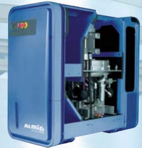
HP, in standard soundproof housing