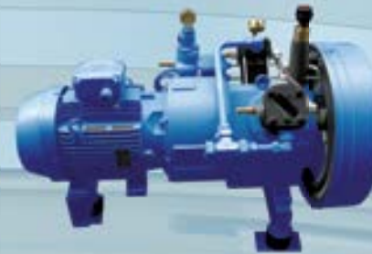
Booster on anti-vibration mounts