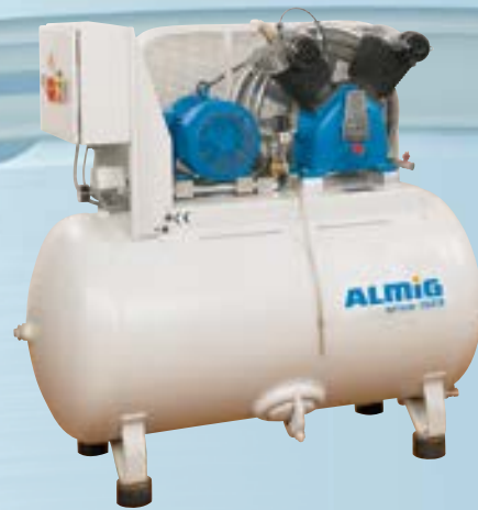
HL on receiver